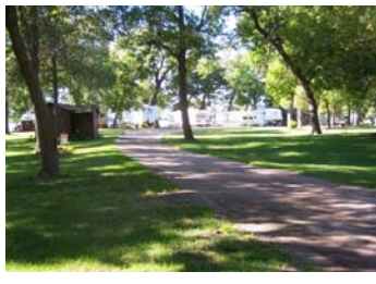
Rustling Elms Resort Seasonal Lots—Center Section

lines we ask as a courtesy to other guests. If you would like more information