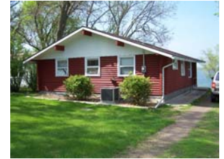
Cabin at Sunset View

a dock and are within walking distance to the swimming beach.