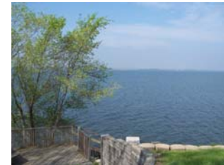
Cabin at Sunset View

No hills or steps to climb to the lake. The Sunset View cabin includes a walk out lower level to a private fire pit area with steps down to the lake and dock. This area has a beautiful view to the lake. This