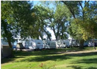
Seasonal RV Lots—North End

Seasonal sites are available between April 15th to October 15th. All lots are within walking distance to the lake. Lots